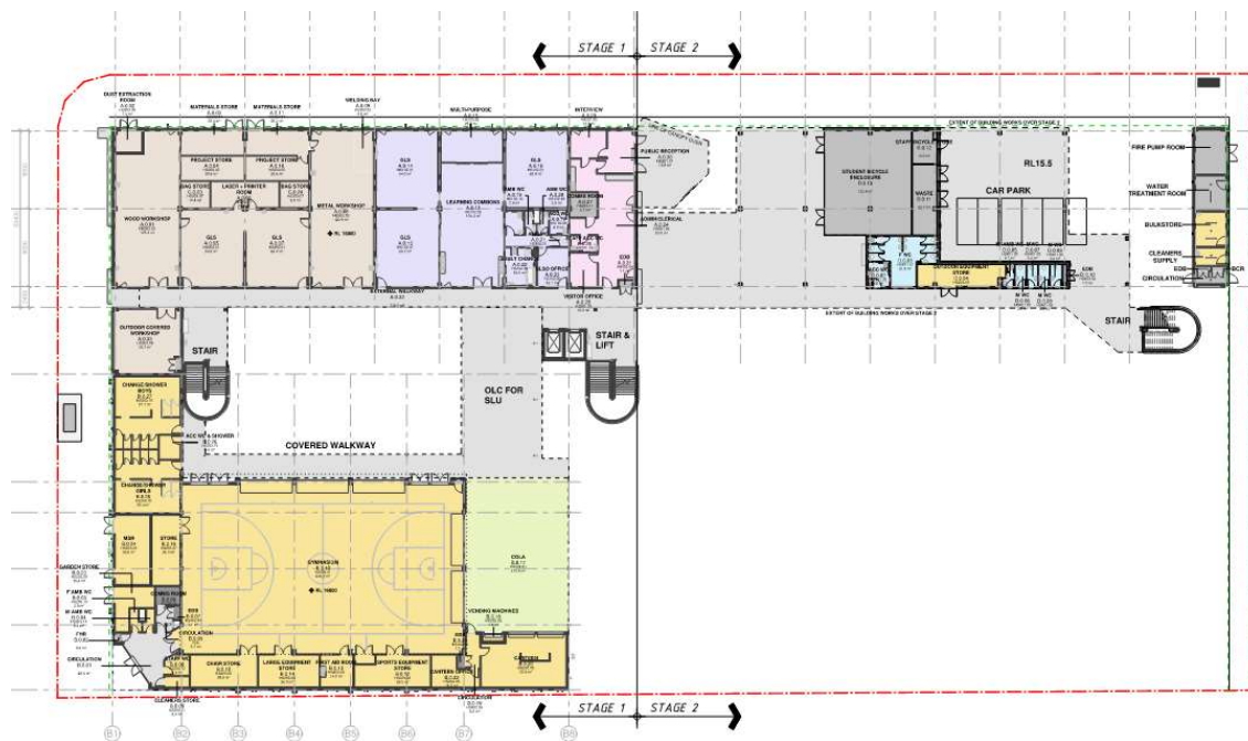
Figure 2: Stage 2 Proposed Site Plan at Completion

Stage 2 of Melrose Park High School (MPHS) is planned to be constructed and operational by 2036. This stage will include the construction of Block D, additional open play areas, increased on-site bicycle spaces, and expanded staff parking. Stage 1 of MPHS is expected to remain operational during the construction of Stage 2. A comprehensive Construction Management Plan (CMP) will be developed to outline measures for safely separating construction activities from school operations. It is estimated the construction of Stage 2 will roughly take 8-12 months to complete.