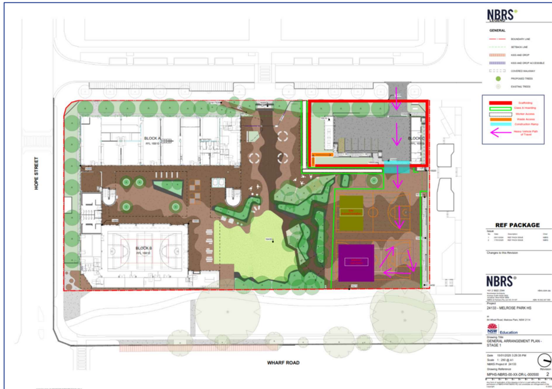
Figure 3: Stage 2 - Example of Construction Site Plan

The open play space provision for the school will be affected as a result of the works to MPHS Stage 2, however, as the open play space calculations for Stage 2 include the provision of the Melrose Park northern playing fields in their calculation at the time of completion, the school is to have this joint use agreement operational prior to the construction of Stage 2 as a mitigation measure.